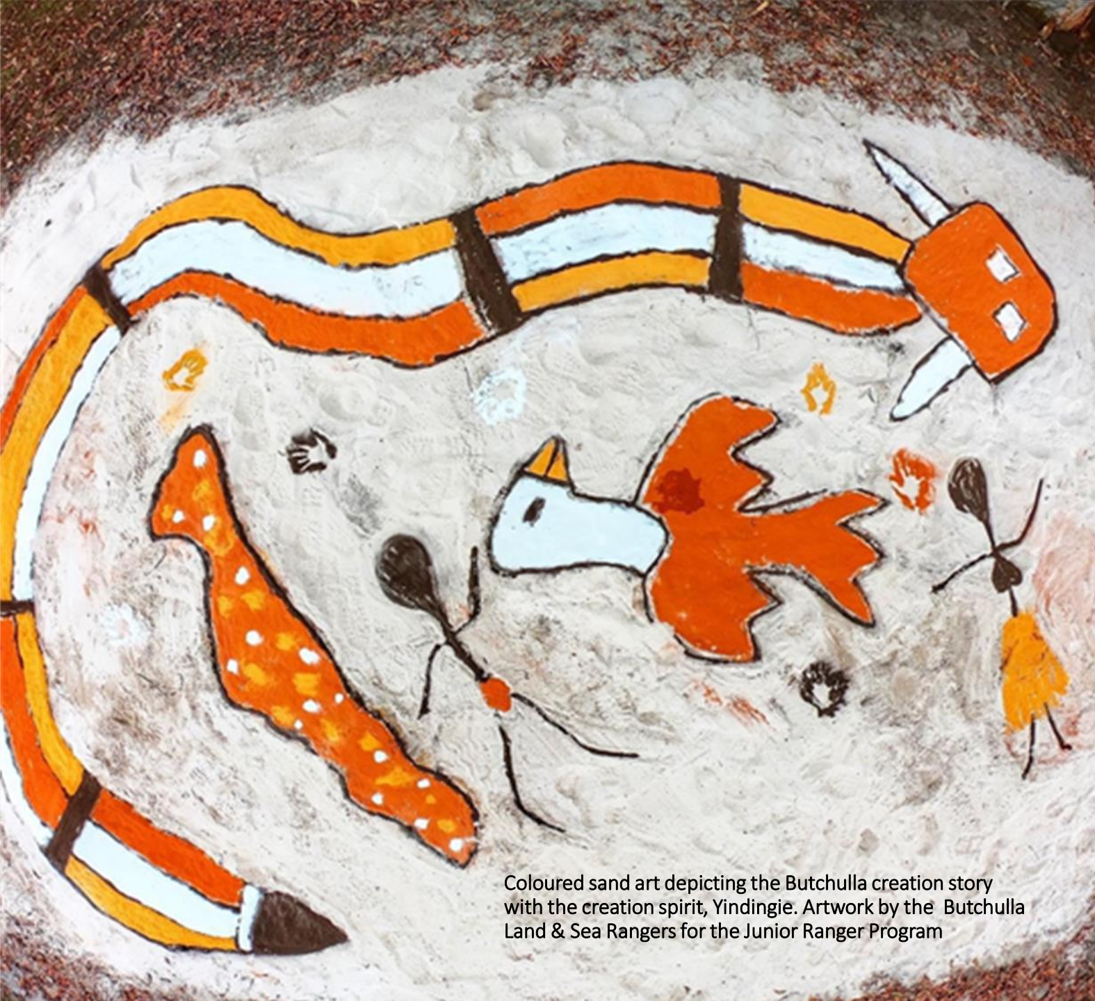
Coloured sand art depicting the Butchulla creation story with the creation spirit, Yindingie. Artwork by the Butchulla Land & Sea Rangers for the Junior Ranger Program